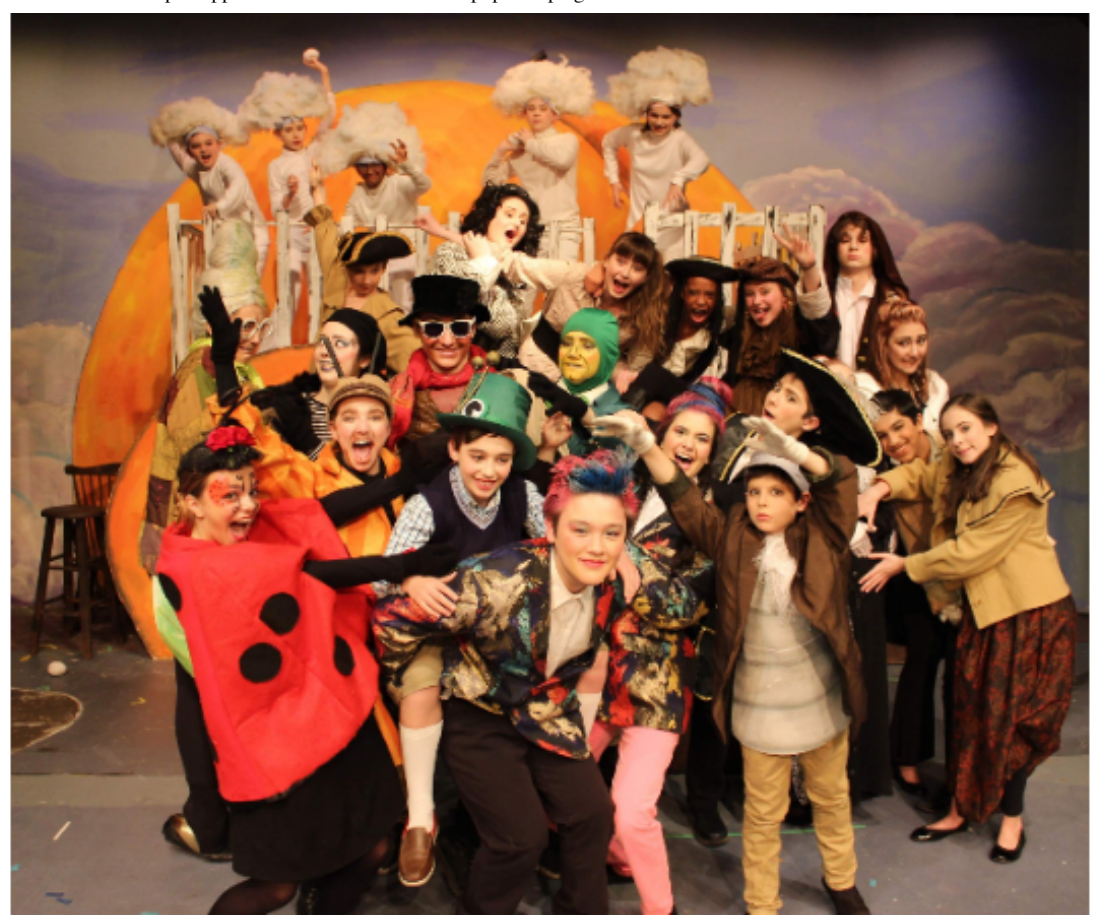
Make a Donation!