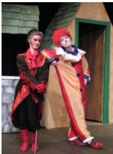
Answer at bottom of newsletter

Assistant Director of the Annual Fund for Young Alumni at Portsmouth Abbey School in Portsmouth, Rhode Island.